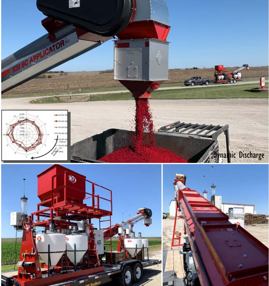
Gentle Seed Handling/Mixing --- Static Mixing Belt Conveyor